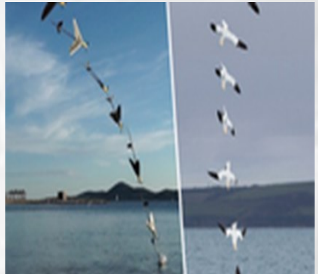
Image of the AquaMAV flying robot diving into water, next to an image of a northern gannet (Morus bassanus), also diving into water.

For example, how are owls able to fly so silently? One team of scientists explored adaptations in owls' wings that could muffle noise, finding that the animals' large wing size and the wings' shape, texture and strategically placed feather fringes all work together to help owls glide soundlessly.