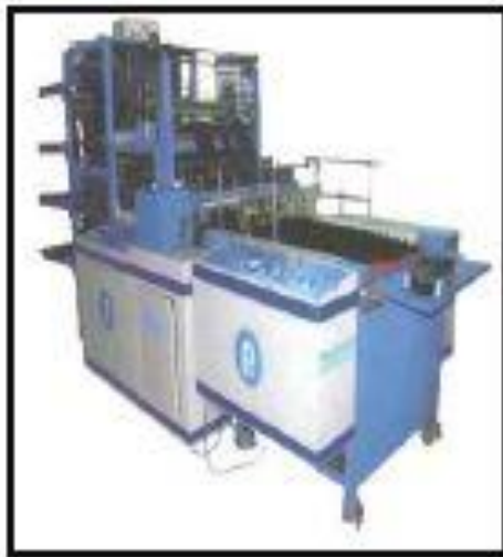
Fig. 2 Polyethene bag cutting and sealing machine.