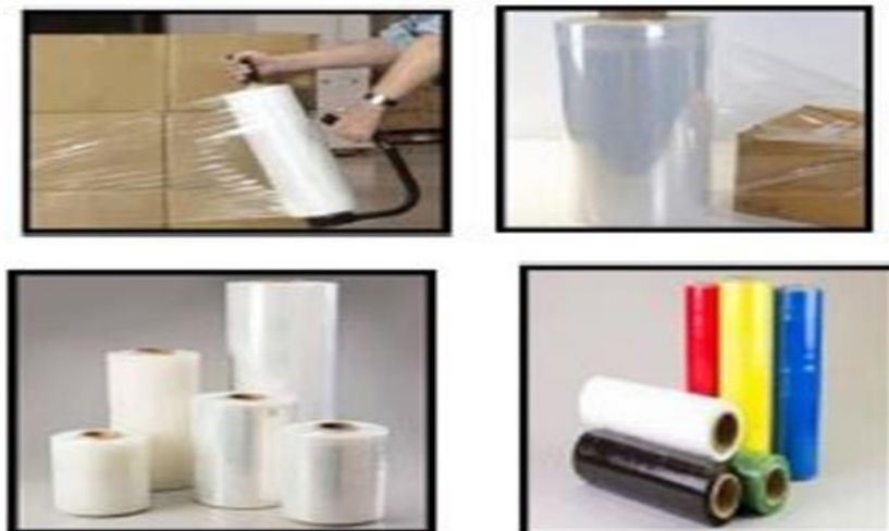
Fig.1 Compostable Polymer alternative to Plastic.

Prioritizing biodegradable materials that offer optimal performance and environmental benefits requires selecting those that decompose efficiently within a reasonable timeframe without compromising functionality. Materials like PLA (polylactic acid) and PHA (polyhydroxyalkanoates) are strong candidates, as they balance durability with the ability to break down under appropriate conditions, such as industrial composting. These materials not only reduce waste but also ensure minimal environmental impact by fully decomposing into non-