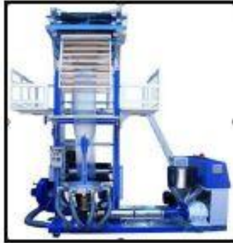
Fig. 3 Plastic bag extrusion with blown film.